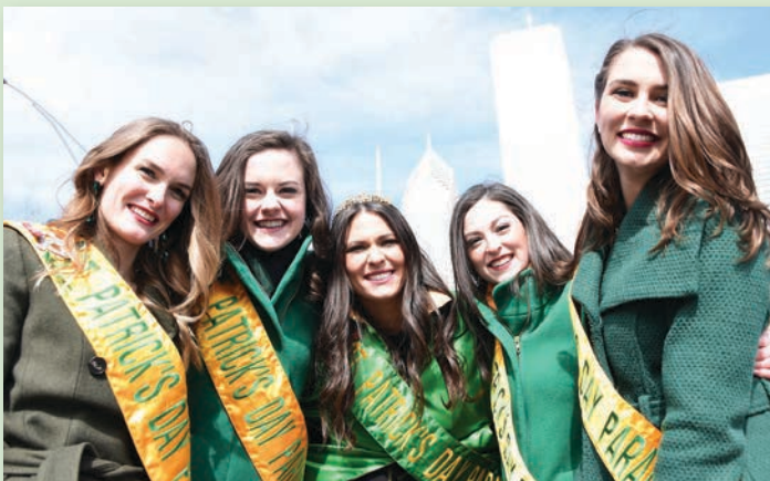
Parade Queen & girls with skyline.