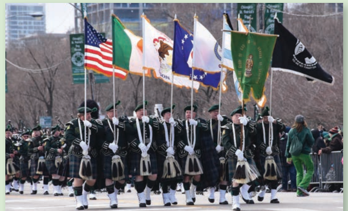
Shannon Rovers with flags.